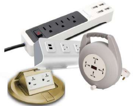
Adaptors, Plugs & Sockets