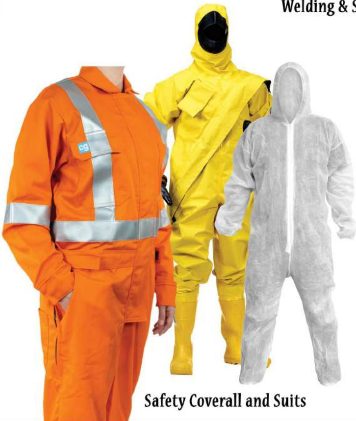
Safety Coverall and Suits