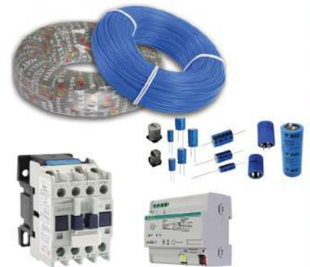
Other Electric Items