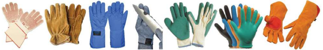
All kinds of Safety Gloves