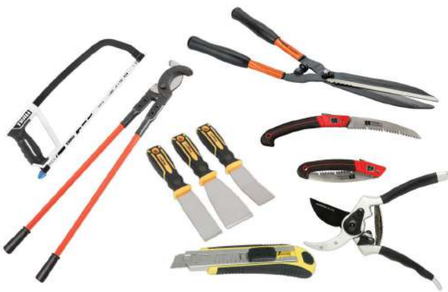
Cutting and Garden Tools