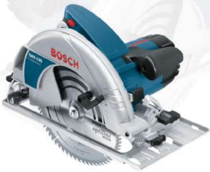
Circular saw Machine