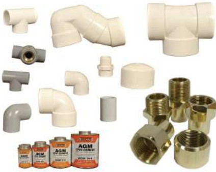
Pipe Fittings for Portable water systems