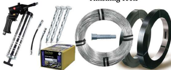
Wire, Steel & Nails