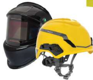
Welding & Safety Helmets