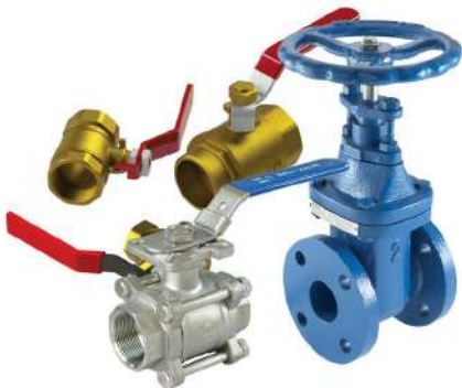
All types of Valves