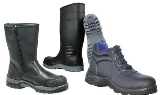
Safety shoes and boots