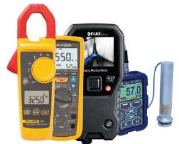
Measuring & Calibration Solutions