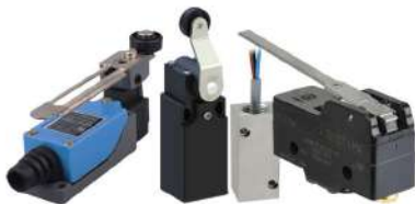
Mechanical Limit Switch