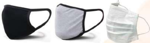
All types of Masks

Workplace safety is very important for each and every employee in the industry because all the workers desire to work in a safe and protected atmosphere. Health and safety is the key factor for all the industries in order to promote the wellness of both employees and employers. It is a duty and moral responsibility of the company to look after the employee's protection.