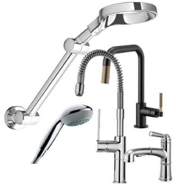
Pipes & Showers