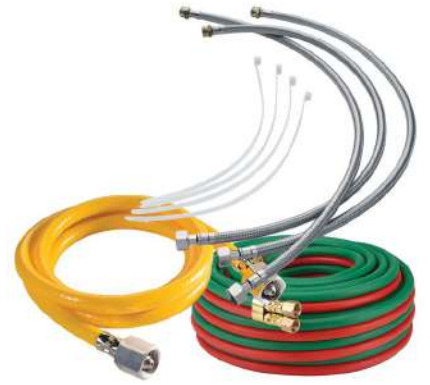
All types of Supply Hose