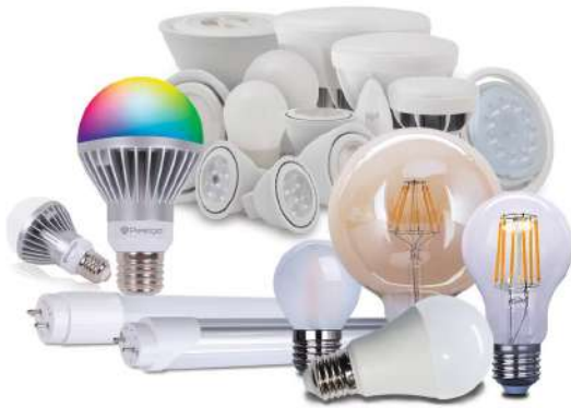
Indoor and Outdoor Lights