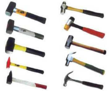
All types of Hammers