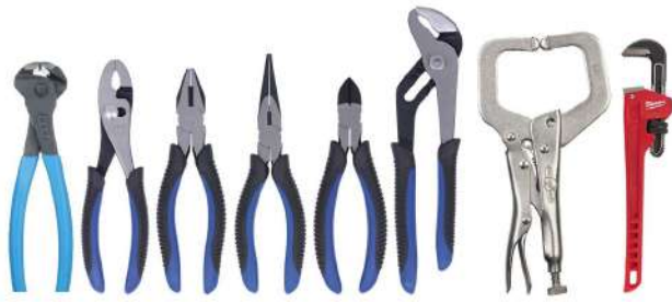
All kinds of pliers and holding tools