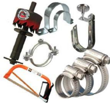
Plumbing Tools & Accessories